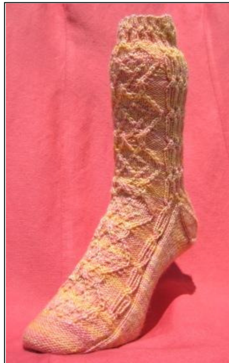
With a Twist sock shown in sock-aholic ® color Bellini